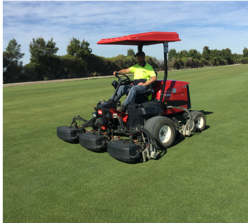
Turf preparation ahead of installation