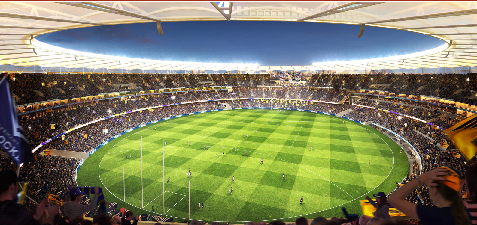
Optus Stadium - AFL format